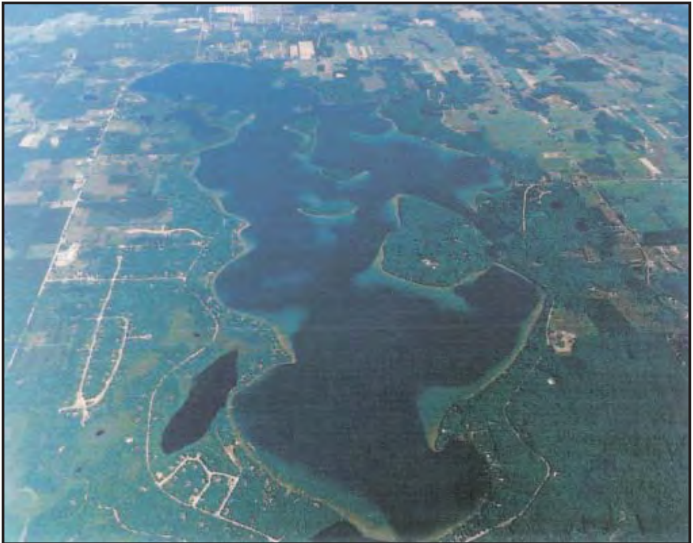
Long Lake Grand Traverse County

Published Quarterly – February, May, August and November